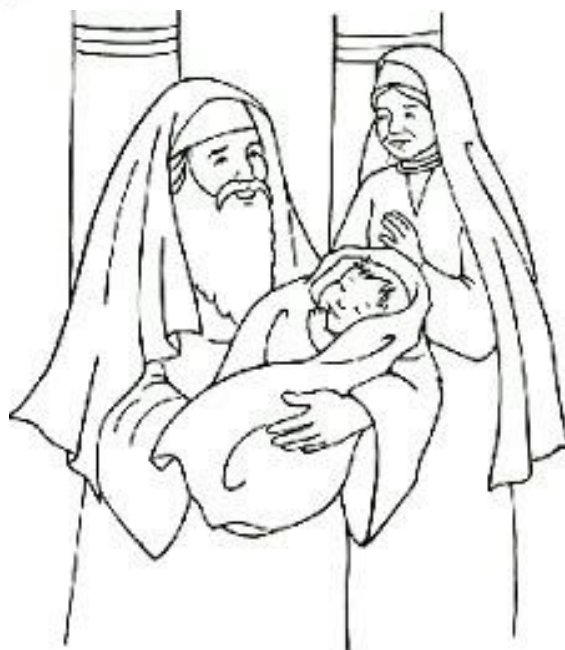
Simeon and Anna Thank God Luke 2

Cross off the words that you hear in Mass today: